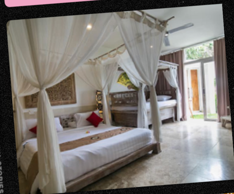
Room Package #4