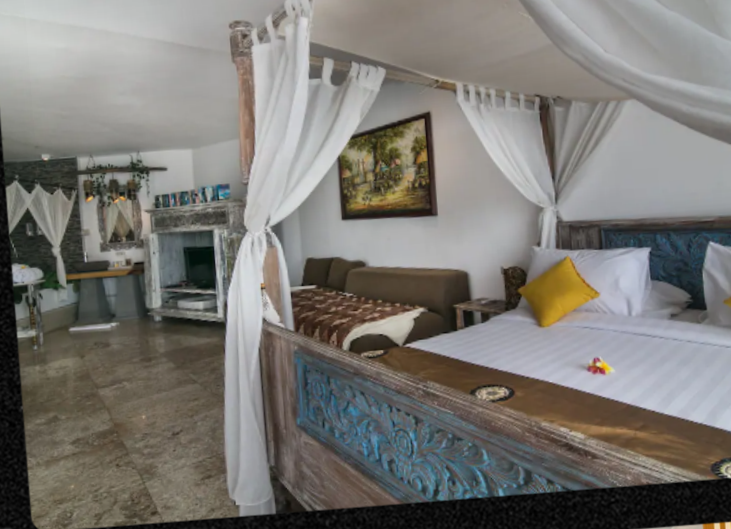
Room Package #5