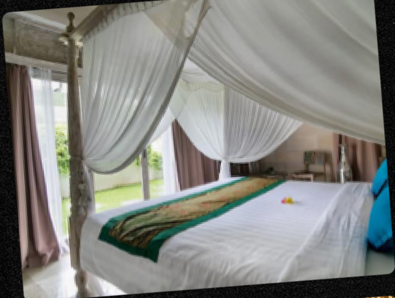
Room Package #3