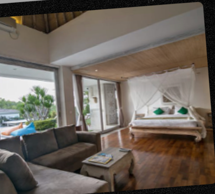
Room Package #1