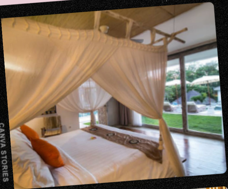
Room Package #2